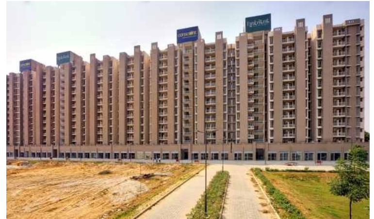
Actual Site Images