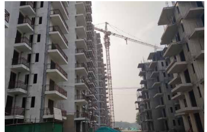
Actual Site Images